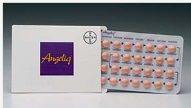
Figure 2: The main panel of the inner package for Angeliq, along with the blister pack of tablets.