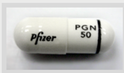
Figure 2 Lyrica 50 mg capsule